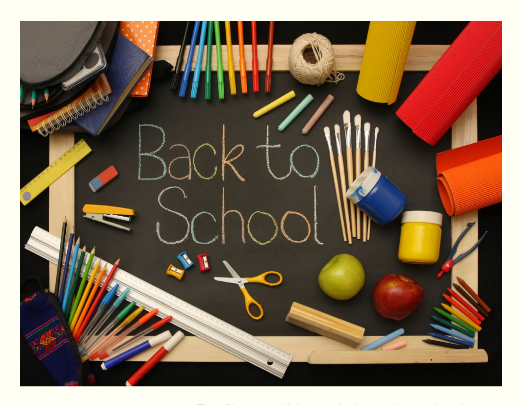
<u>This Photo</u> by Unknown Author is licensed under <u>CC BY-SA</u>