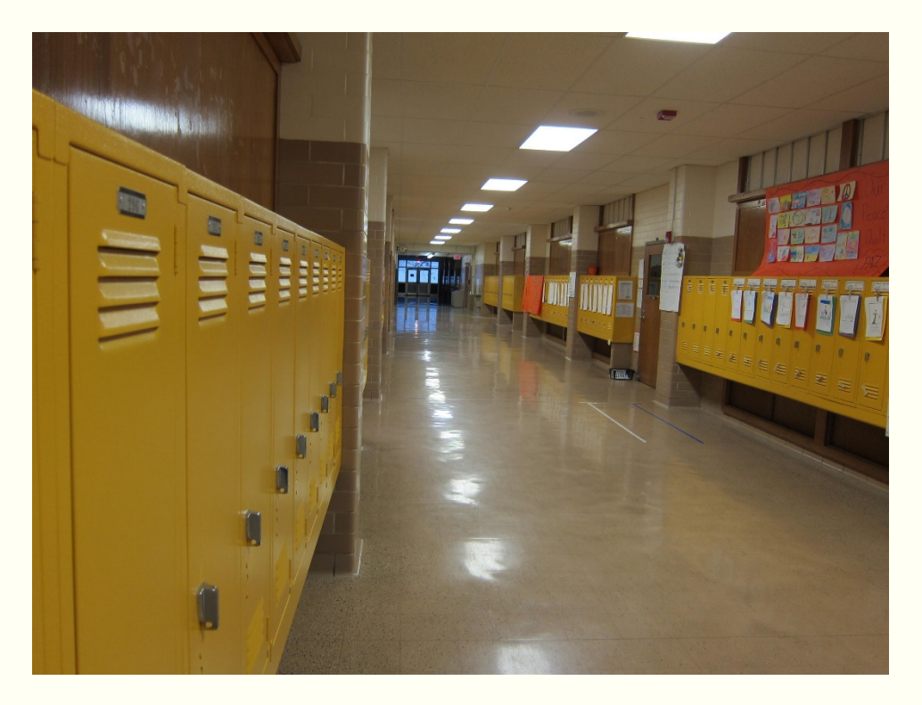
<u>This Photo</u> by Unknown Author is licensed under CC BY-SA-NC